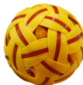
Women | / Junior